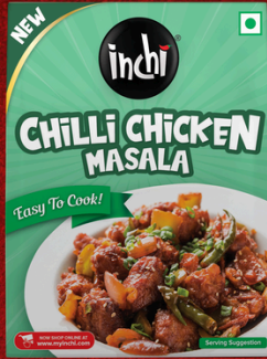
Chilli Chicken Masala 20g, 60g, 100g