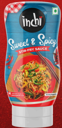
Sweet & Spicy Stir-Fry Sauce