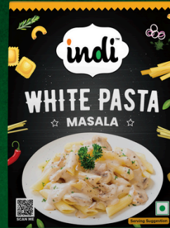
White Pasta Masala