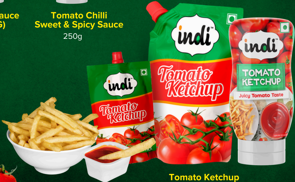
Tomato Ketchup 90g, 200g, 250g, 950g & 5kg