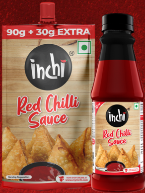
Red Chilli Sauce