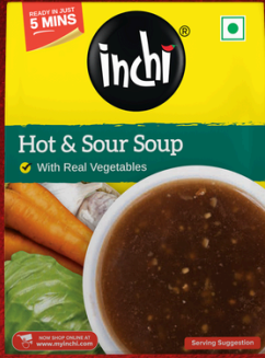
Hot & Sour Soup 48g