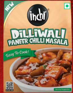
Dilliwali Paneer Chilli Masala 20g, 60g, 100g