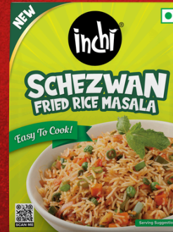
Schezwan Fried Rice Masala 20g, 60g, 100g