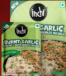
Burnt Garlic Masala 20g, 60g