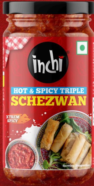
Hot & Spicy Triple Schezwan