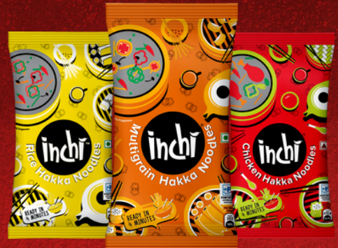
Rice Hakka, Multigrain Hakka & Chicken Hakka Noodles