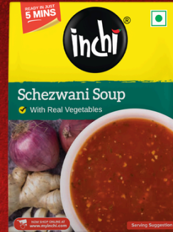
Schezvani Soup 48g