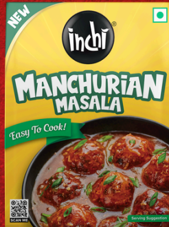
Manchurian Masala 20g, 60g, 100g