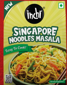
Singapore Noodles Masala 60g

Each 100g Multipack contains 5 single-use packs of 20g each.