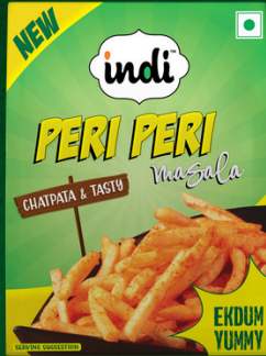
Peri Peri Masala