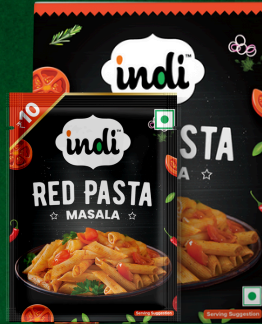
Red Pasta Masala