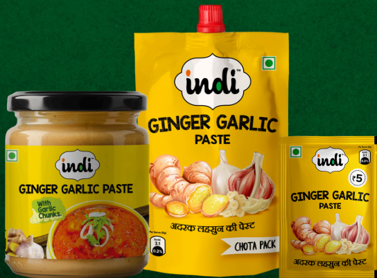
Ginger Garlic Paste