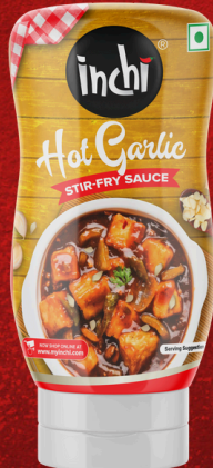
Hot Garlic Stir-Fry Sauce