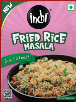
Fried Rice Masala 20g, 60g, 100g