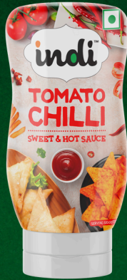
Tomato Chilli Sweet & Spicy Sauce 250g