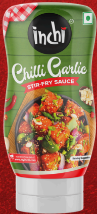
Chilli Garlic Stir-Fry Sauce