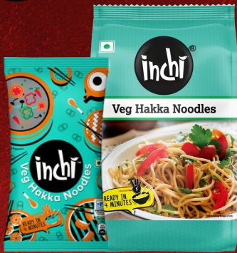
Veg Hakka Noodles