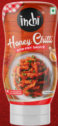
Honey Garlic Stir-Fry Sauce