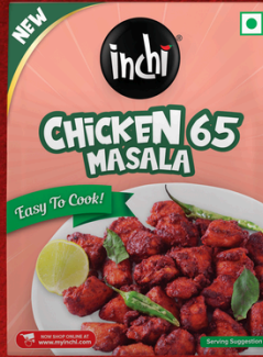
Chicken 65 Masala 60g