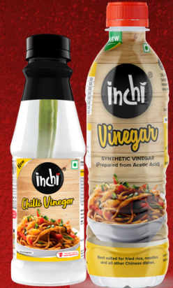
Chilli Vinegar 180ml