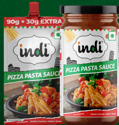
Pizza Pasta Sauce