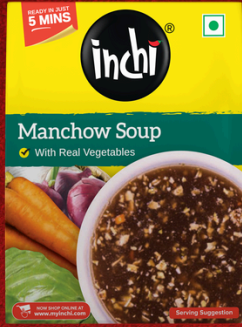
Manchow Soup 48g