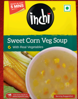
Sweet Corn Veg Soup 48g