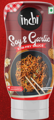
Soy & Garlic Stir-Fry Sauce