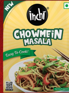
Chowmein Masala 20g, 60g, 100g