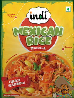
Mexican Rice Masala