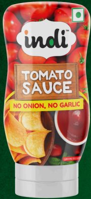
Tomato Sauce (NONG) 250g