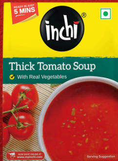
Thick Tomato Soup 53g