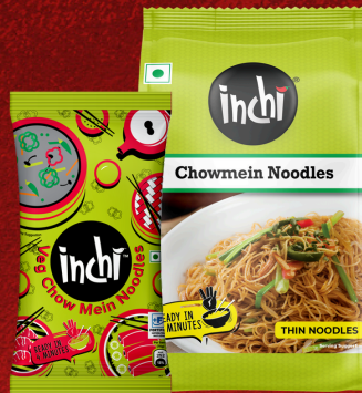
Chowmein (Thin) Noodles