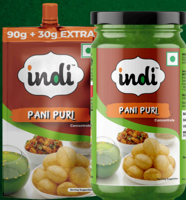
Pani Puri Concentrate*