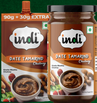
Date Tamarind Chutney*