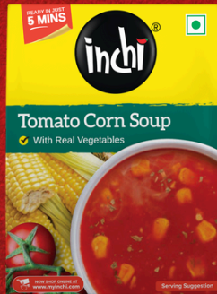
Tomato Corn Soup 53g