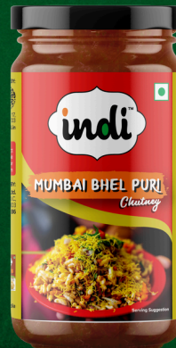
Mumbai Bhel Puri Chutney