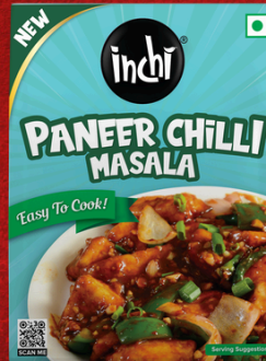
Paneer Chilli Masala 20g, 60g, 100g