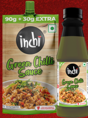
Green Chilli Sauce