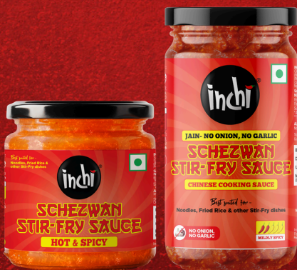
Schezwan Stir Fry Sauce