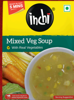
Mixed Veg Soup 48g